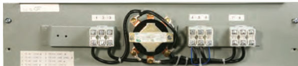
*Back Cover Not Shown